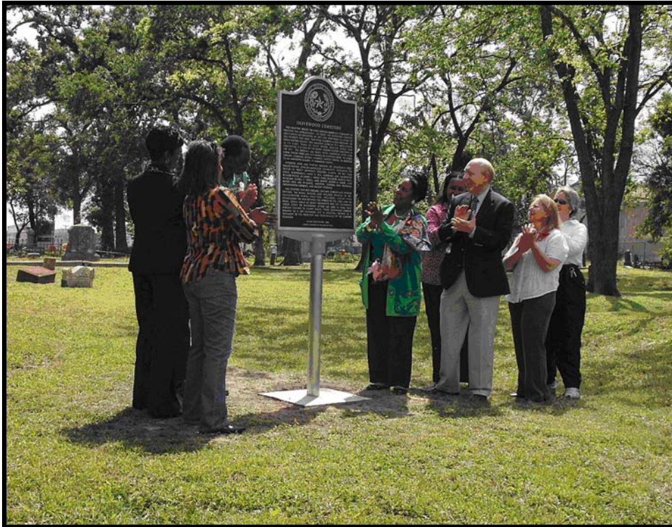
Dedication of Olivewood Cemetery as a Texas Historical Site (April 3, 2009). Mayor Bill White and Congresswoman Sheila Jackson Lee are in attendance.